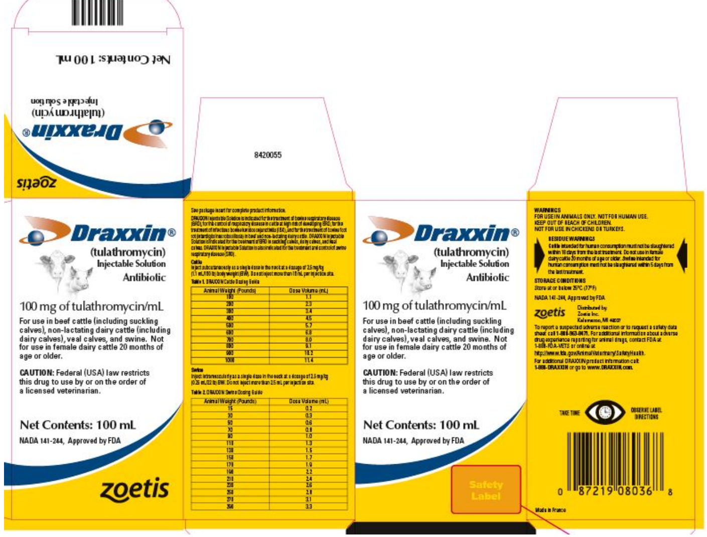
100 mL carton Label Draxxin Made in France