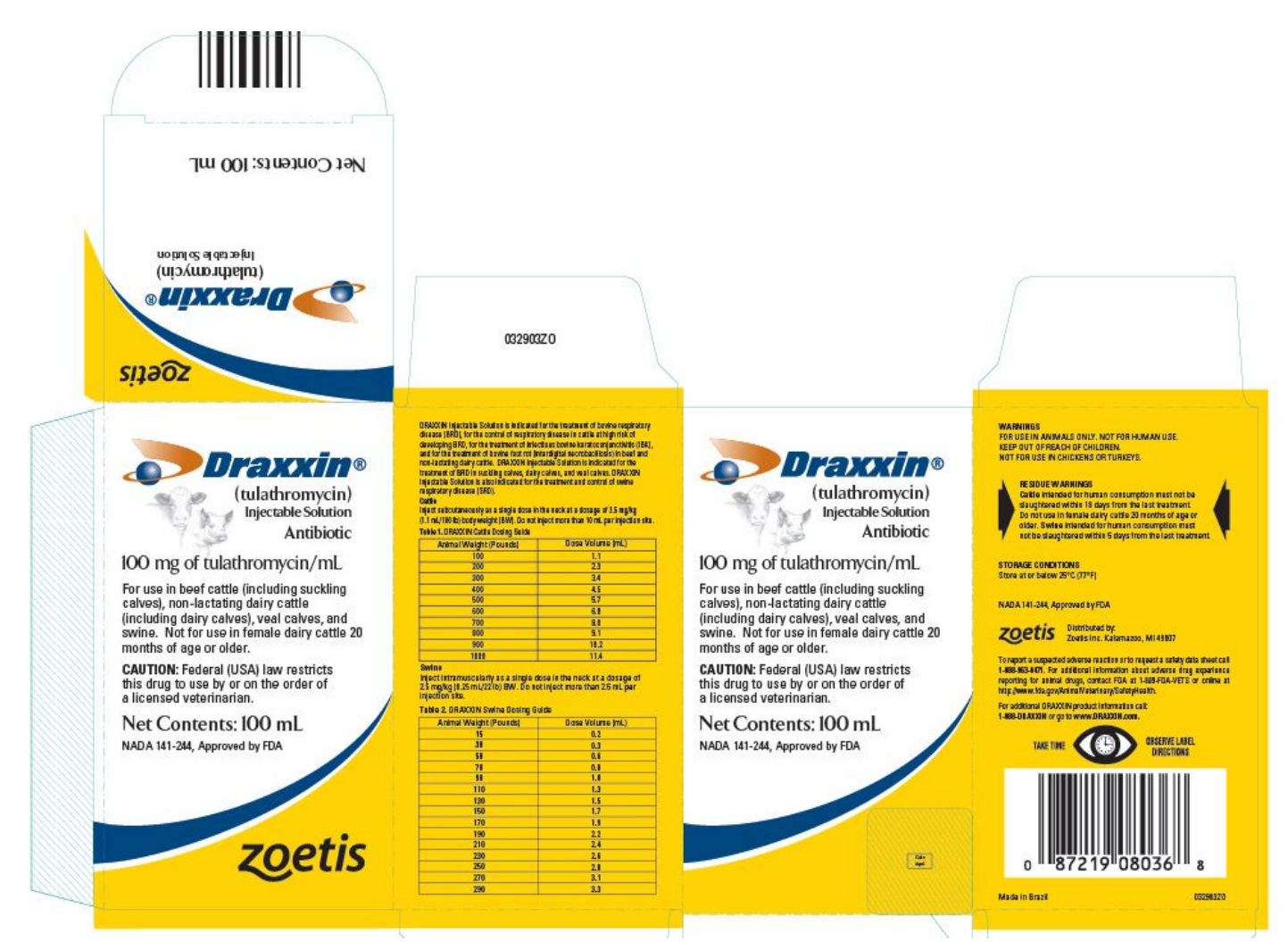
100 mL Carton Label Draxxin made in Brazil